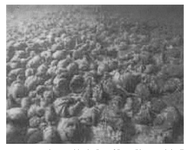
Figure 3. Crepidula fornicata overgrowing maerl in the Bay of Brest.

The slipper limpet Crepidula fornicata was accidentally introduced to France sometime between the 1940s—60s along with oysters for aquaculture. This calyptraeid gastropod has since spread along the whole Channel-Atlantic coast of France (De Montaudouin et al. , 1999). In shallow bays, it can completely smother the sediment creating beds with several thousand individuals per m² (Figure 3). Thouzeau et al. (2000) described Crepidula grounds as a separate biotope with its own characteristic community. Dense aggregations of C. fornicata trap suspended silt, faeces and pseudofaeces which alter the specific composition and structure of benthos (Chauvaud et al. , 2000). Live maerl thalli become covered in Crepidula and the interstices of the deposit become clogged with silt; this kills the maerl thalli and