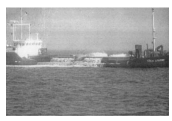
Figure 1. The Côtes d'Armor ; a maerl extraction dredger in use on the Glenan maerl banks in SW Brittany, June 1997. Note the suspended sediment that is washed overboard.

1950) and 86.22 +/- 0.39 modern ^{14} C enrichment. The subsurface thalli (code AA-49821) had a conventional radiocarbon age of 5862 +/- 57 years BP and 48.2 +/- 0.34 modern ^{14} C enrichment (errors all +/-1\sigma level for overall analytical confidence). Thus the 10 m thick Glenan maerl bank has been slowly accumulating over much of the Holocene.